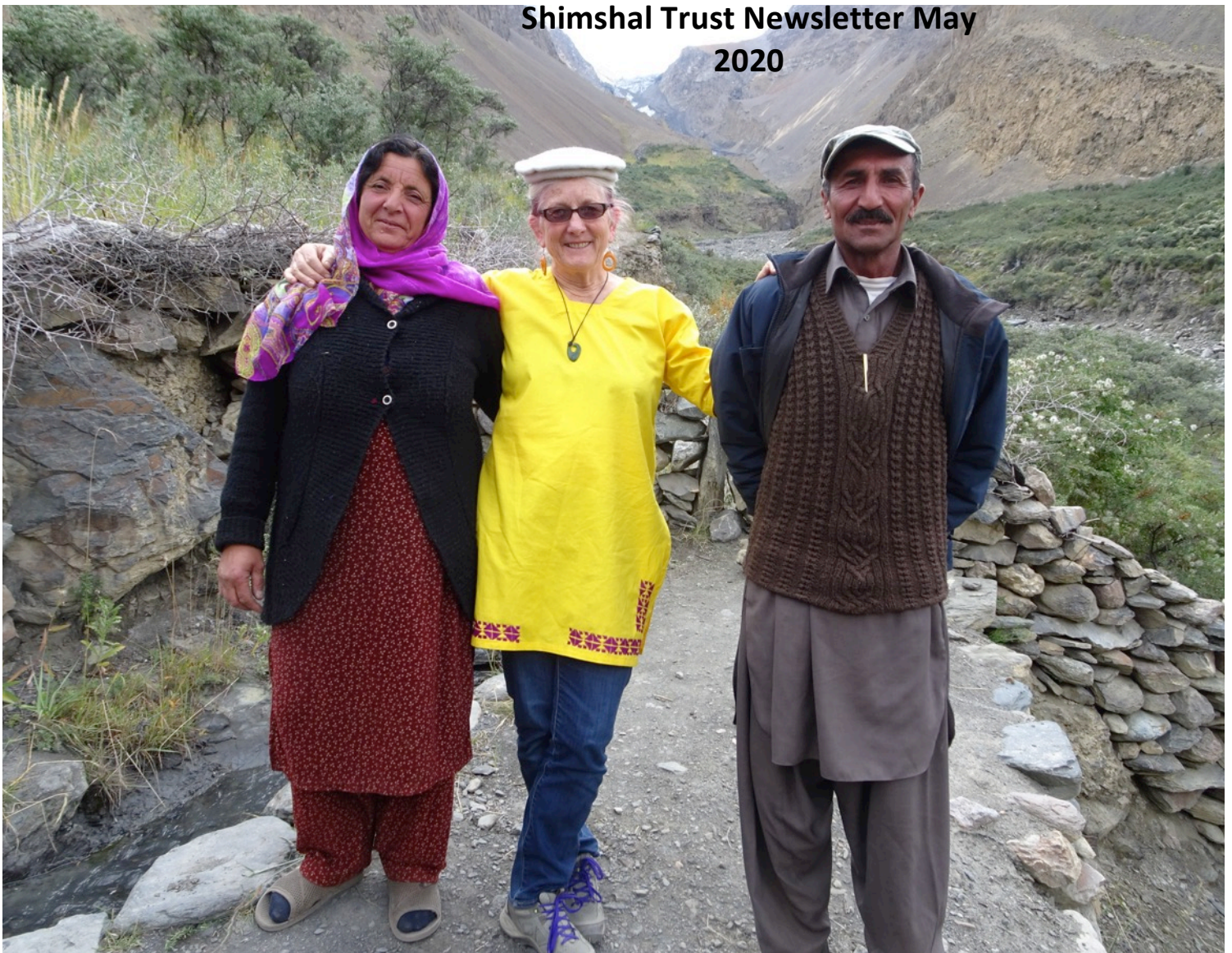
Making connections - Shimshal friends